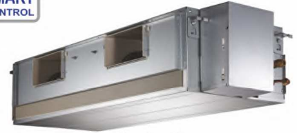
48, 60 (K)