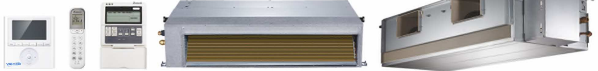
18, 24, 36 (K)