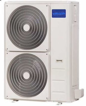
48, 60 (K)