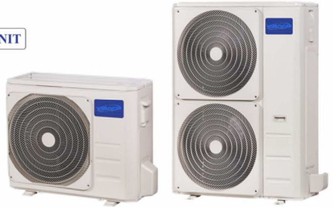
18, 24, 36 (K)