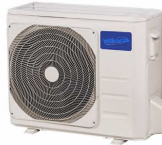
18, 24, 36 (K)